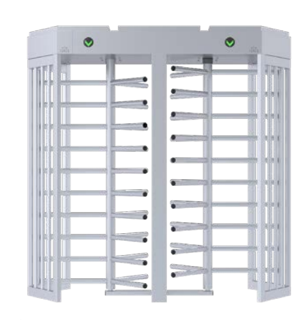
LTF 413 D