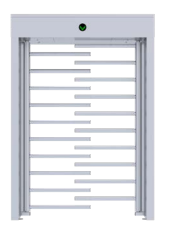
LTF 413 SG