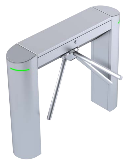
Durapod DT 350