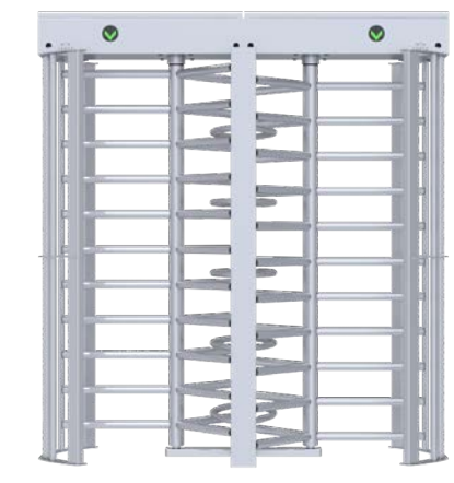
LTF 213 D