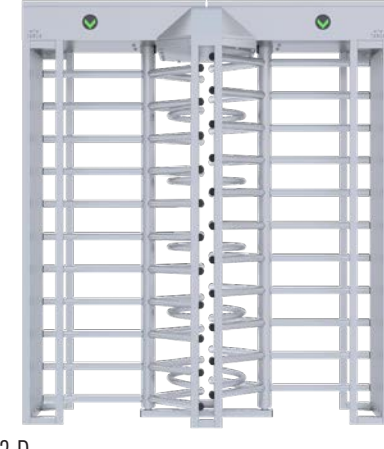
LTF 113 D