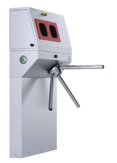
Durapod DT 590