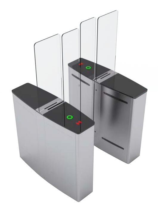
LTOP 301 STR

LTOP Speed Gates Turnstiles are designed to be used in places where luxury and prestige come to the fore, such as banks and holdings, and for fast and busy visitor personnel entrances. Architects and decorators are given the chance to make very different super models in LTOP Speed Gates Turnstiles. In addition to wood, marble, granite, leather, and various walnut, oak, and olive veneers are used to create very luxurious solutions and special decorations.