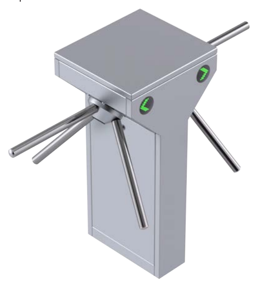
Durapod DT 520