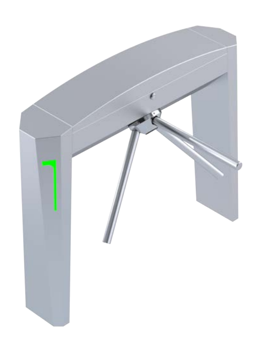
Durapod DT 400