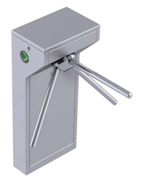
Durapod DT 500