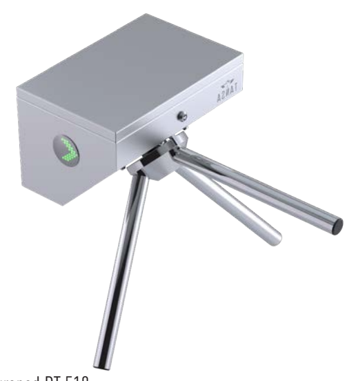
Durapod DT 510