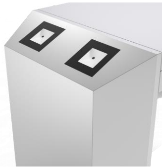
QR/Bar Code Solution