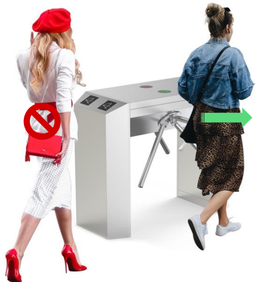
Anti-trailing Function: one person can pass at one time